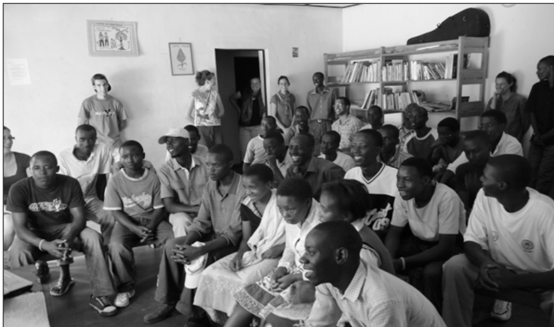
Young people at Centre Marembo with Canadian volunteers from I 1 AMIE. See Centre Spotlight .